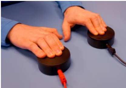
"Press and Test" Travel Probes

Meets requirements of ANSI/ESD S4.1, S7.1, S2.1 and STM12.1 and STM97.1